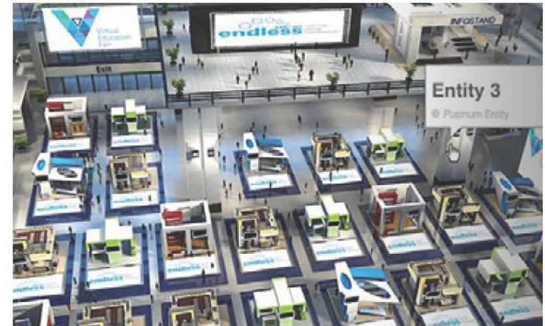
IDA 2021 Online Exhibition Hall (example)

Create private survey at your booth and get feedback from your visitors. Visitors can leave you their business cards with contact information at your stand