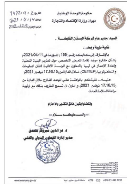
Invitation letter by the Libyan Government

ITIDA has been invited by the Libyan Government to concentrate its first online trade fair on "Reconstruct Libya". Many Libyan companies and decision makers will be obliged to visit the trade fair.