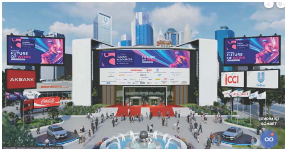
IDA 2021 main landing page with sponsor logos (example)

Please get in touch if you are interested in one of our sponsorship packages with additional pre-event, event and post-event marketing measures.