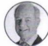
Lord Peter Lilley Member of the House of Lords, United Kingdom